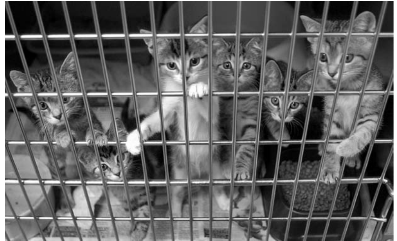
Step three: kitten room on the adoption floor

Bondra, get to work. When they say, “they’re ready” every kitten will be vaccinated and spayed or neutered. After recovery, and when space is available, the kittens move along, one step closer to going home.