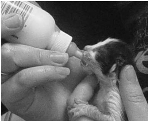
Step one: kitten foster care

In summer 2007, there were crates and cages all over our shelter as we struggled to make it through kitten season. 300 kittens were inside the shelter, 100 were in foster care. We saved and adopted almost every one of them.