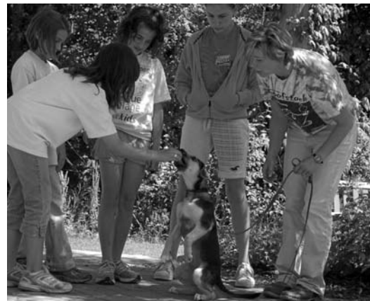
Gathering Place Camp at Rescue Village