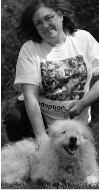
Hope and Dublin

There is something about having a senior dog that is deaf. We rely on hand signals and touch although I am convinced he is learning my expressions. When we walk I sometimes miss the “conversations” I used to have with my “hearing” dogs. Still, in his way, Dublin listens very carefully and he has taught me a lot about what it means to say, “I’m all ears”.